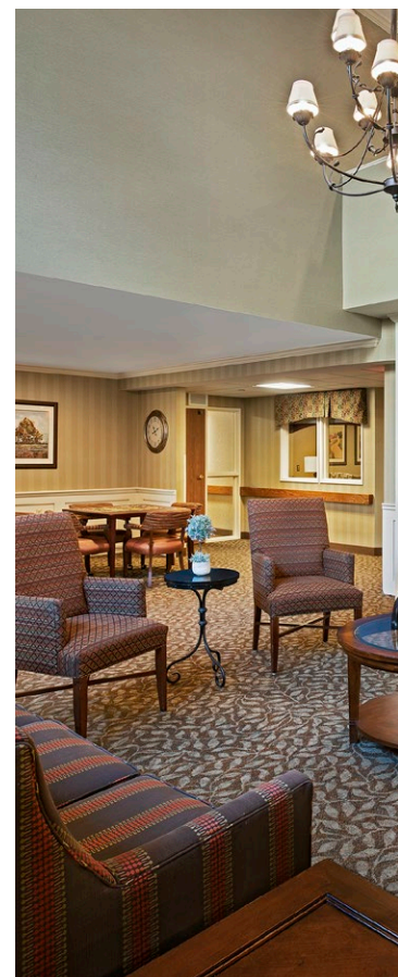
Photos shown from our portfolio of American House images, individual communities differ.

Our relaxing community offers beautifully landscaped grounds, community gardens, a secure, private courtyard and walking path.