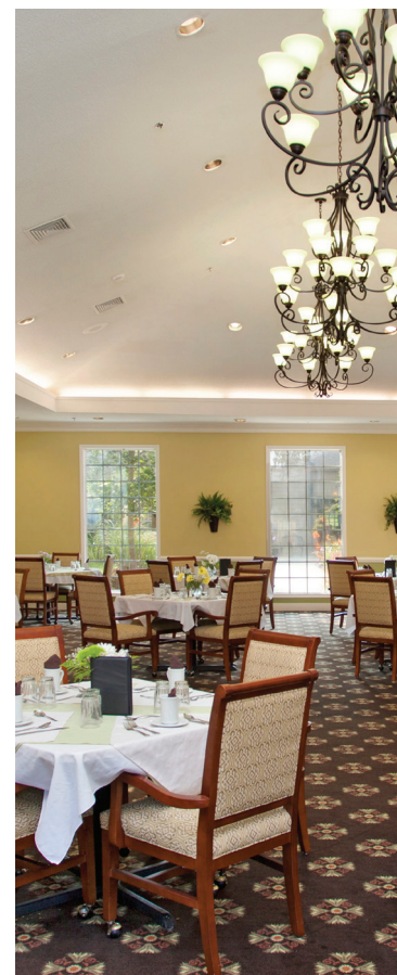
Photos shown from our portfolio of American House images, individual communities differ.

Our relaxing community offers beautifully landscaped grounds, courtyards, walking paths and gardens to enjoy birds and butterflies.