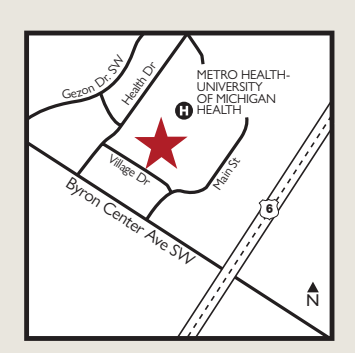
Assisted Living | Memory Care

5812 Village Dr SW | Wyoming | MI | 49519