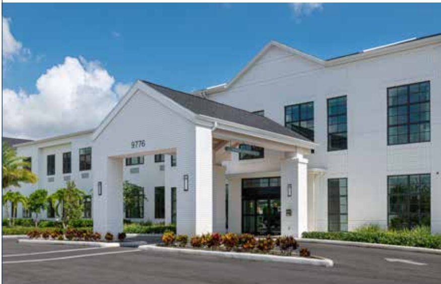
American House Boynton Beach 9776 Jog Rd | Boynton Beach | FL | 33437

Make our house your home and there is no telling what exciting things your next chapter will bring!