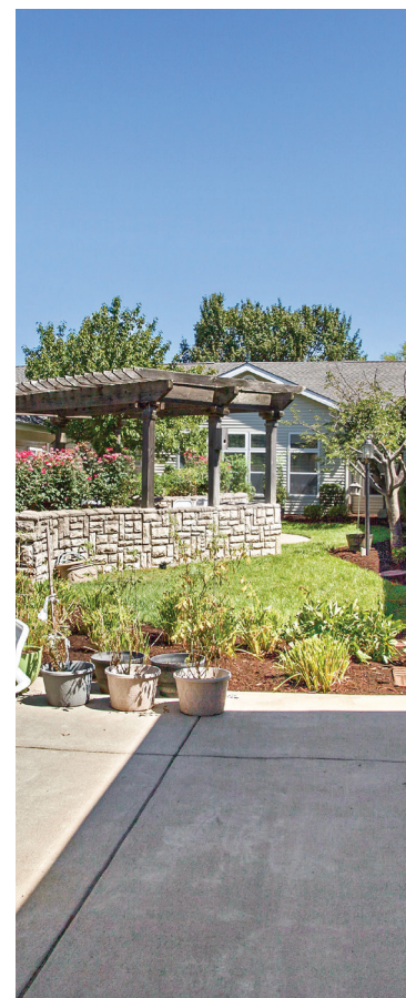
Photos shown from our portfolio of American House images, individual communities differ.

Every day offers something new, whether it's enjoying one of our many events or catching up with friends at our weekly happy hour.