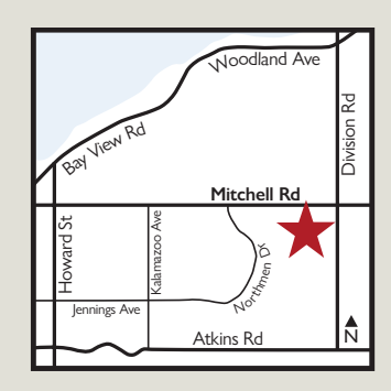
Independent Living | Assisted Living

2000 E Mitchell Rd | Petoskey | MI | 49770