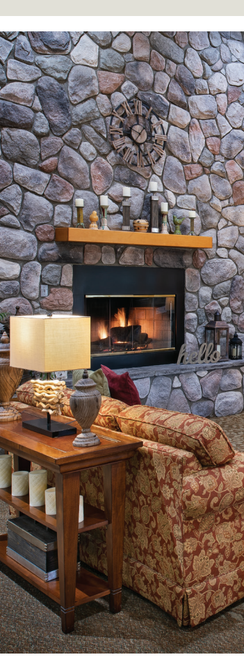
Photos shown from our portfolio of American House images, individual communities differ.

Our signature stone fireplace invites long visits with family, while exciting events and daily activities let you explore new interests.