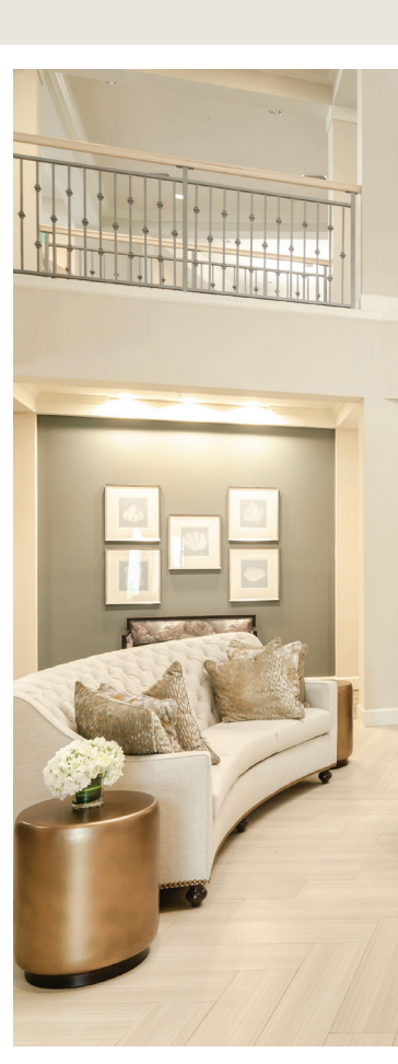
Photos shown from our portfolio of American House images, individual communities differ.

Our idyllic wooded community offers beautifully landscaped grounds, gardens and secure outdoor deck and walking path.