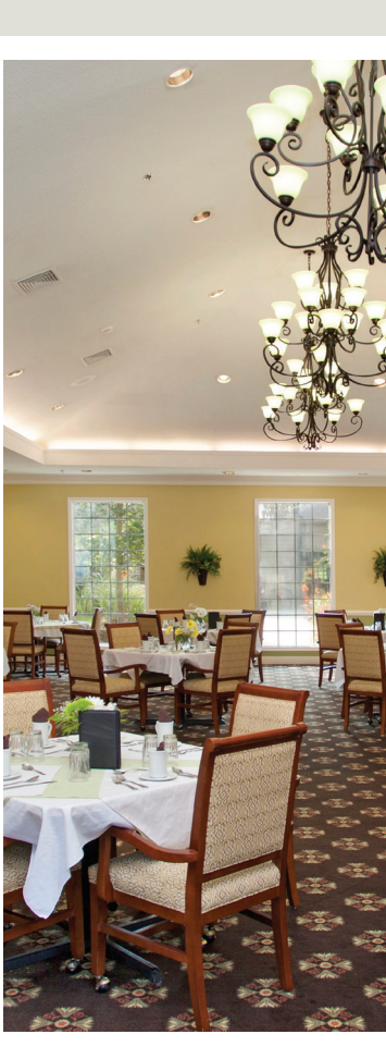
Photos shown from our portfolio of American House images, individual communities differ.

Our relaxing community offers beautifully landscaped grounds, courtyards, walking paths and gardens to enjoy birds and butterflies.