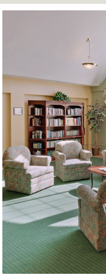
Photos shown from our portfolio of American House images, individual communities differ.

Our relaxing community offers comfortable common spaces – like our large outdoor patio and historic Harold's Deli and Café.