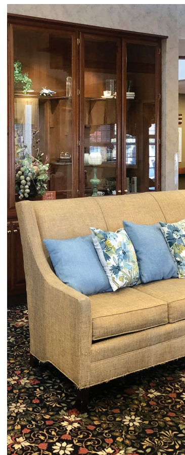
Photos shown from our portfolio of American House images, individual communities differ.

Our relaxing community offers secure, private courtyards, walking paths and comforting sunrooms and common spaces.